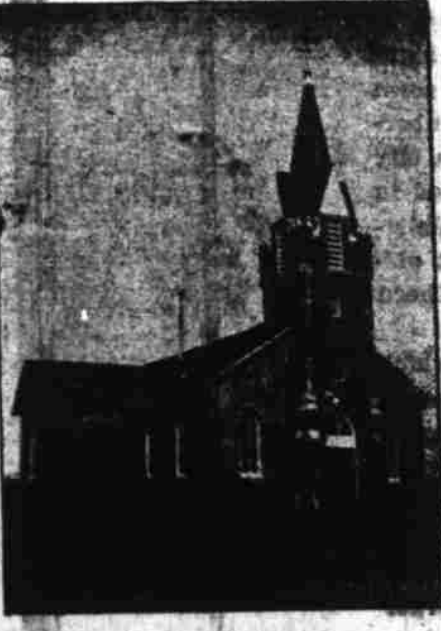
Historic pioneer Catholic church in St. Paul, Oregon. First brick church built in the Pacific Northwest.

A high school conveniently located and modern in its equipment affords an opportunity for the boys and girls to complete the 12th grade and be ready to enter college.