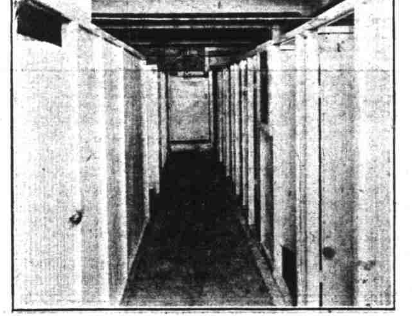
View of corridor in men's department with shower baths and steam room in background

Alone with other of the features of the institute is a perfectly built plunge for the treatment as well as the pleasure of Salem folks. Its popularity is already established under the capable direction of the Lew owner, and daily almost countless people visit its properly heated, sanitarily sterilized water for sun and amusement. A device which reculates the inflow keeps an even temperature, and causes the water at the same time to have a