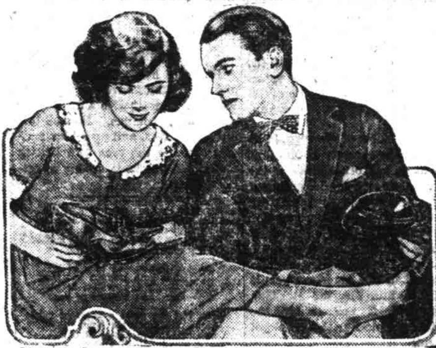
Richard Barthelmess and Dorothy MacKail in "Twenty-One"