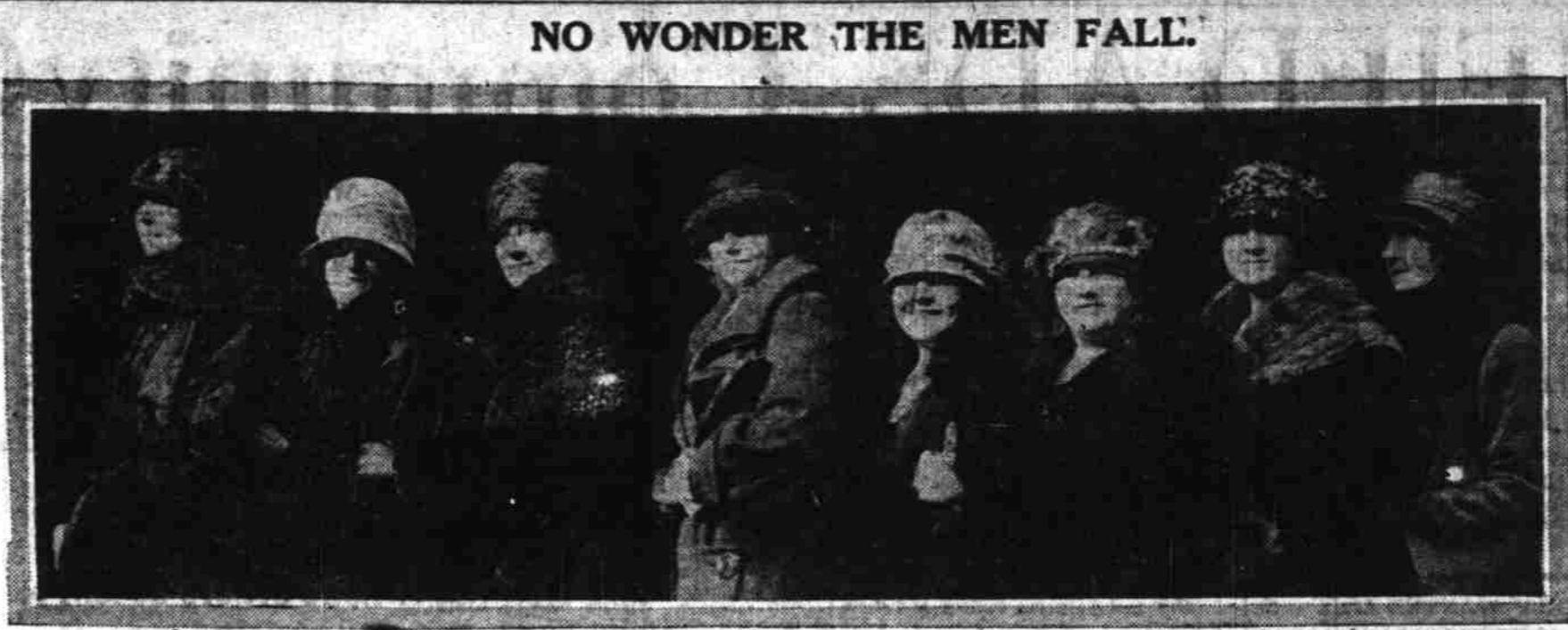
The Police Department of New York has a "Masher Squad" which roams the subways, the street cars, frequent the