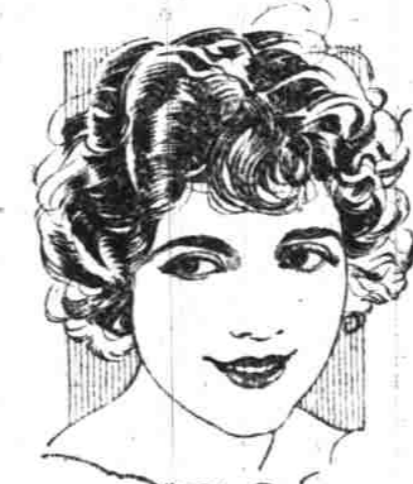
Lois Wilson in the Paramount Picture "The Call of the Canyon"