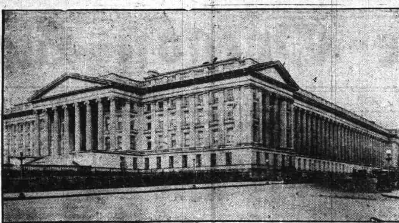
WHERE MR. MELLON PRESIDES