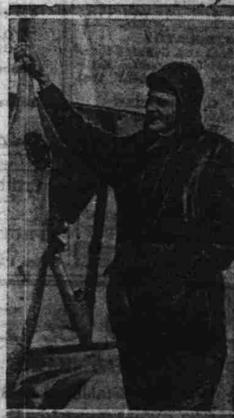
LOST IN CHANNEL.

It is feared that Lawrence B. Sperry, the young American airman, was drowned in the English Channel while flying to Amsterdam. His wrecked plane was recovered three miles from Rye on the south coast by coast guards. Workmen on the shore near Pett saw the baby plane crumple and fall into the water. The Pett coast guards notified Rye, and a lifeboat was sent out. The wrecked plane was towed in, but the aviator was nowhere to be found.