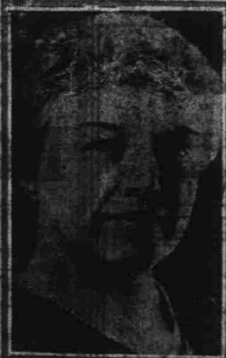
ON EXECUTIVE COMMITTEE.