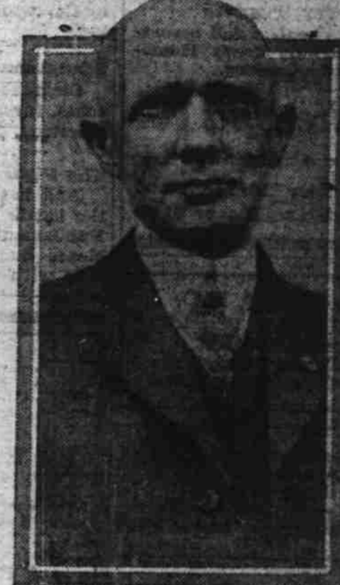
DISCOVERER OF TRUTH SERUM.