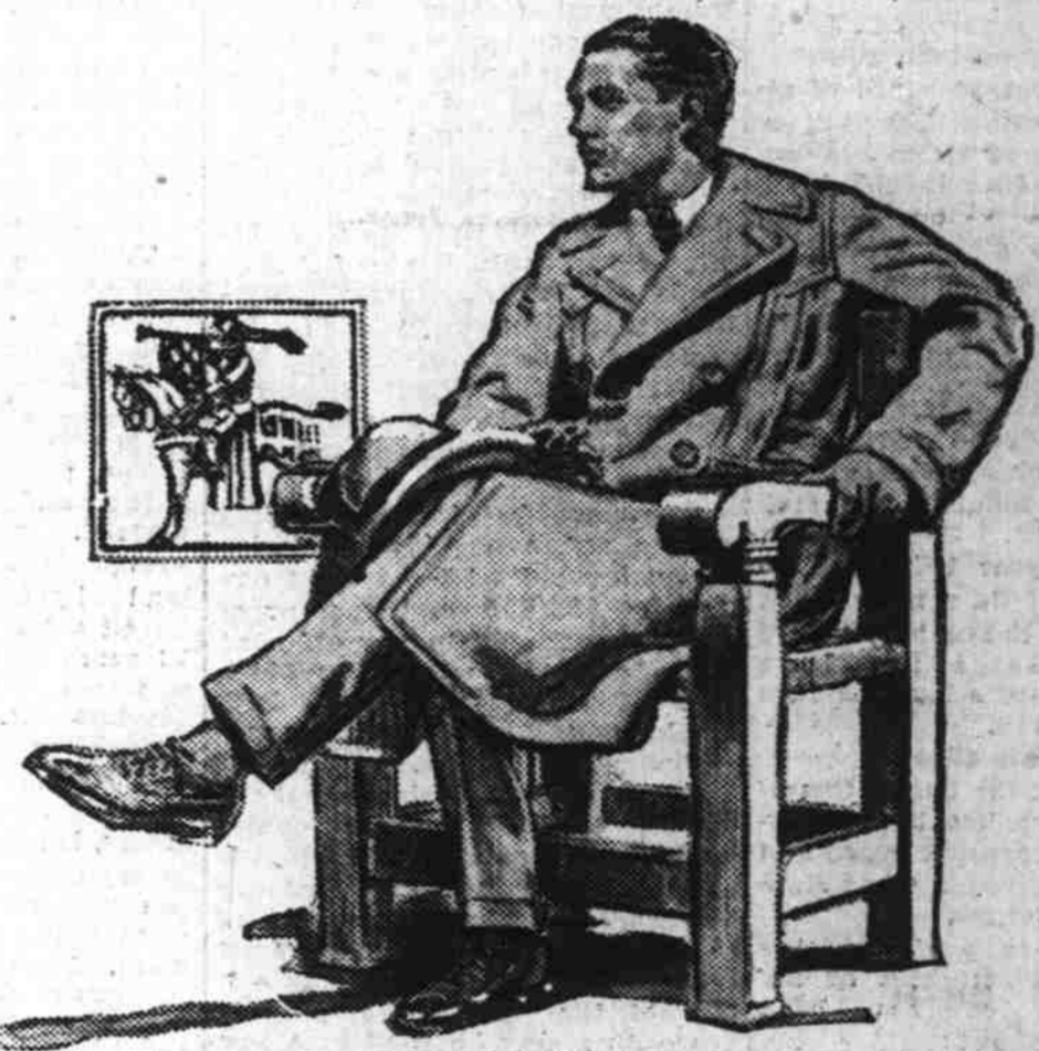
Copyright 1923 Hart Schaffner & Marx

MR. MAN! PLAY SANTA CLAUS TO YOURSELF With a Gift of a Fine OVERCOAT