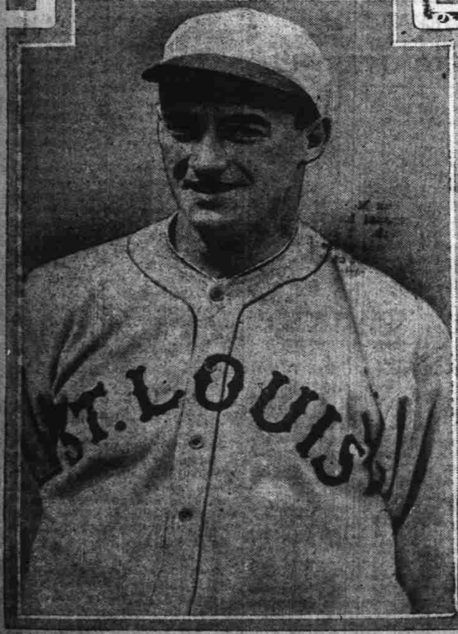
Urban Shocker, the disciplined pitcher of the St. Louis Browns, whom Manager Miller Huggins would like to recapture for his