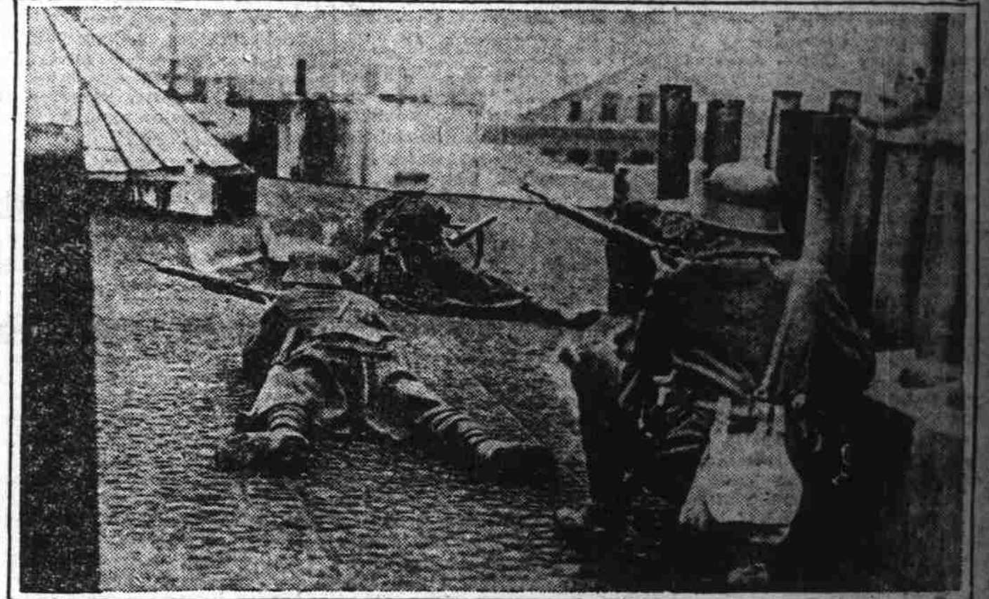
German police firing from house tops on sharpshooters of Communist forces in Hamburg.