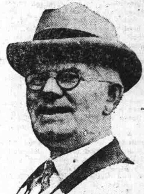
Representative Martin B. Madden.

A group of middle-west Republican members of the house has started a boom for Representative Martin B. Madden as speaker of the house when congress convenes next month. Their plan is to have Speaker F. K. Gillette given an ambassadorial post—probably to Italy—that his place may be filled by Madden without any embarrassment to the former.