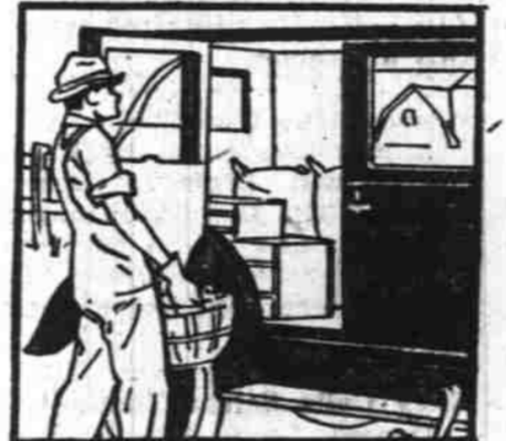
50 cu. ft. of space for farm produce, luggage, etc., by removing rear seat and upholstery.