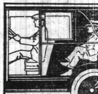
Rear seat also adjustable to accommodate tall or short people.