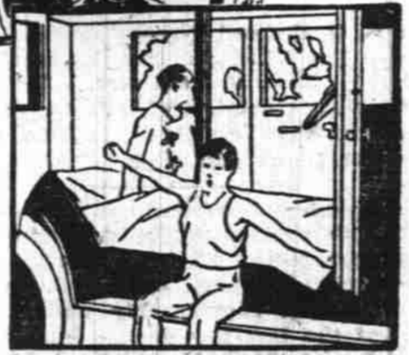
Both seats and upholstery make into a full-length, full-width bed in car for camping.