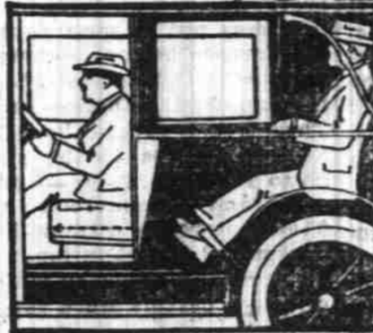
Front seat adjusts to three positions to accommodate short driver or tall driver.

Purchased from VICK BROS., Salem, Oregon