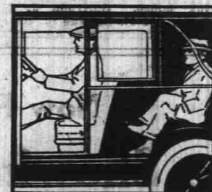
Rear seat also adjustable to accommodate tall or short people.