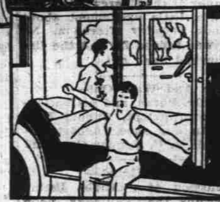
Both seats and upholstery make into a full-length, full-width bed in car for camping.

Purchased From Vick Bros., Salem, Oregon