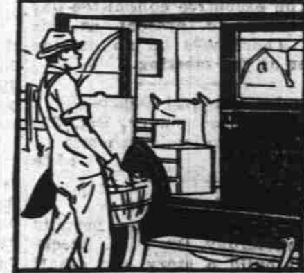
50 cu. ft. of space for farm produce, luggage, etc., by removing rear seat and upholstery.