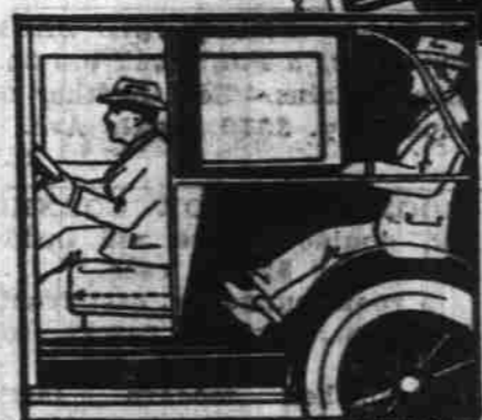
Front seat adjusts to three positions to accommodate short driver or tall driver.