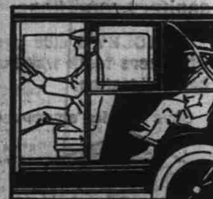
Rear seat also adjustable to accommodate tall or short people.