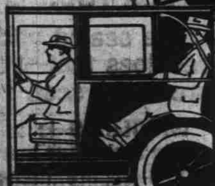
Front seat adjusts to three positions to accommodate short driver or tall driver.