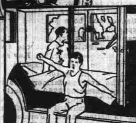
Both seats and upholstery make into a full-length, full-width bed in car for camping.