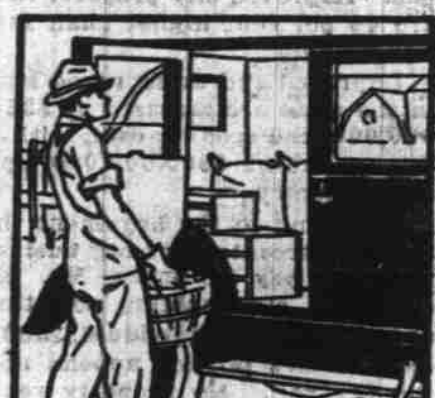
50 cu. ft. of space for farm produce, luggage, etc., by removing rear seat and upholstery.