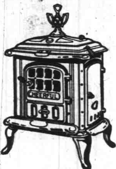
Montag's CHEERFUL Heater

FOR QUICKER COOKING; AND BETTER BAKING INSTALL A COLONIAL IN YOUR HOME NOW!