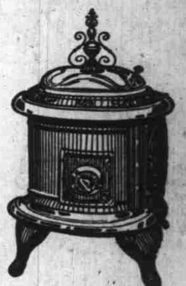
Montag's ORION Heater

A fine sturdy little wood heater, with heavy nickeled parts. Polished steel body. Cast iron linings. The most serviceable and attractive heater of its type ever offered to home owners. Comes in three sizes.