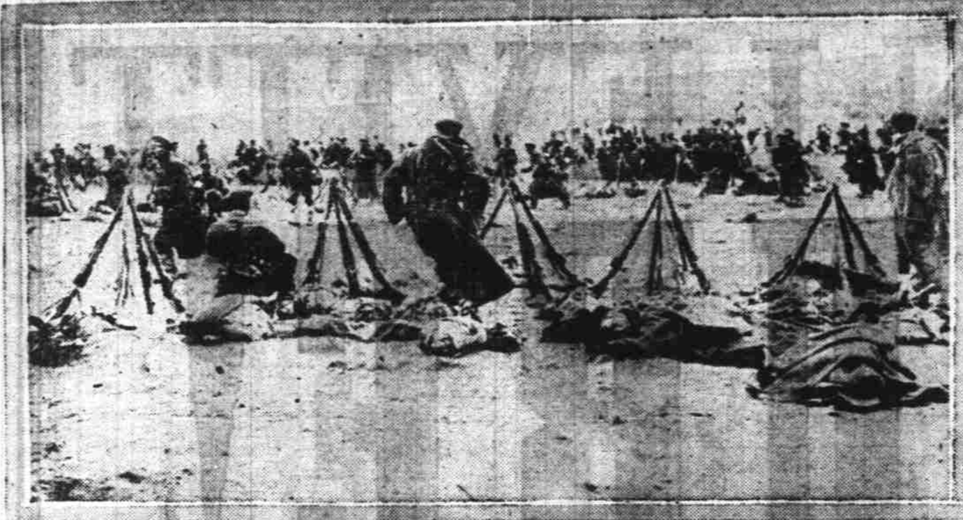
Insurrection in Bulgaria is spreading and gathering strength; 100,000 peasant, a majority of whom are armed, are marching on Sofia in an attempt to overthrow the Government. Bulgar towns along the Jugo-Slav frontier are showing special activity, and many Communists have been slain in clashes throughout the country. Photo shows Bulgarian troops.