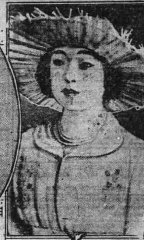
Crown Prince Hirohito, Regent of Japan, and Princess Nayako, who were to have been married this autumn, but the ceremony will not take place until later owing to the sorrow into which Japan has been thrown.