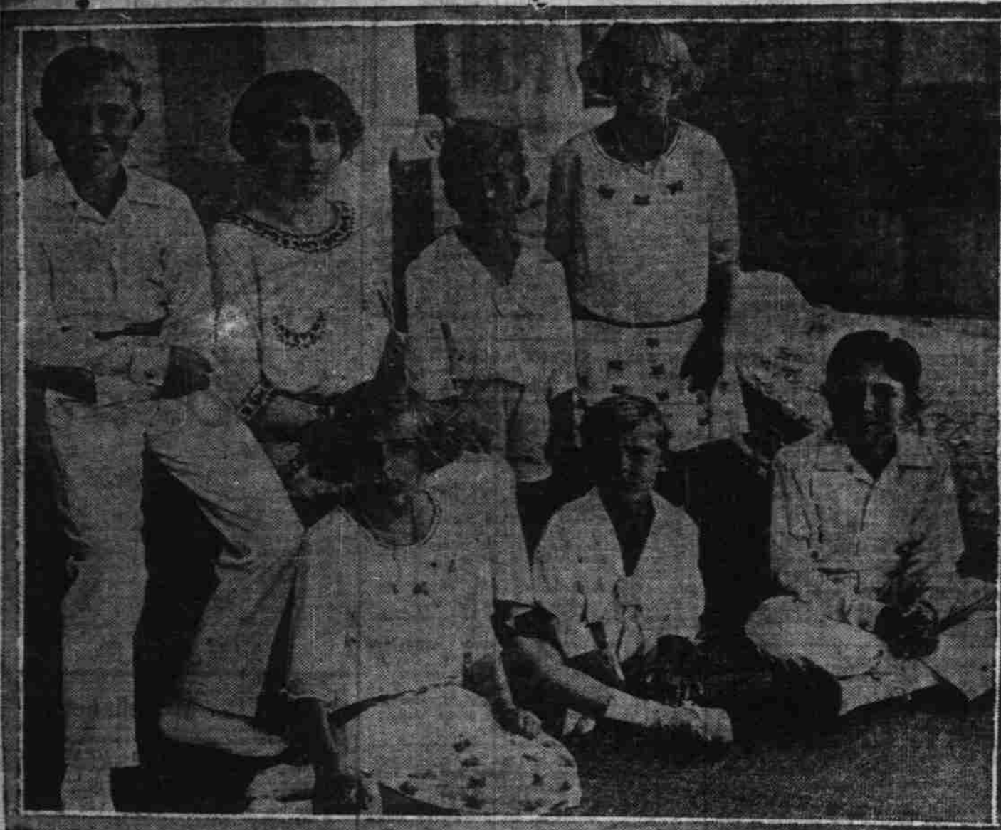
Photo shows the Queen of Spain and her children: Prince Alfonso, Prince Jaime, Princess Beatrice, Princess Maria Christina, Prince Juana and Prince Gonzalo. They are reported to be in danger due to the present outbreak.

it. The thorns are working up through, but he placed the thorns there himself.