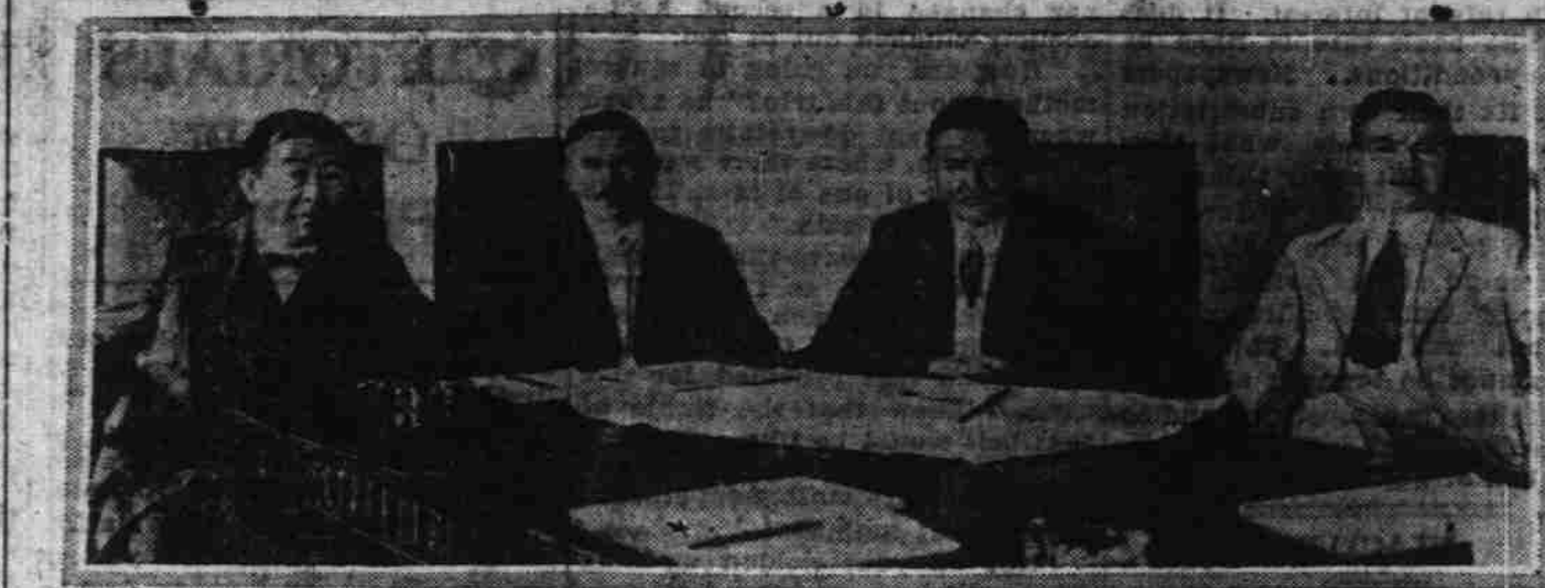
The plans for the relief campaign to aid the Japanese Empire in its disaster were completed in Washington with the Japanese Ambassador to the United States, Masamune Hanihara, and the officials of the American Red Cross.