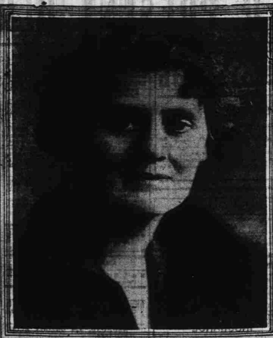
Countess Markievicz, one of Emma De Valera's most loyal adherents, who was executed with a well aimed egg on threatening to resume campaign of violence in Ireland.