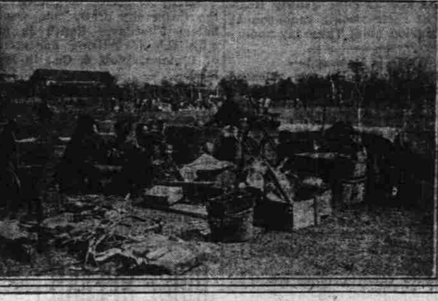
Homeless—Members of a Japanese family and their few belongings saved from the Yokohama fire of 1919. Stacked at the rear are the thick straw mats which serve as combination floors and beds. No furniture is to be seen, because the ordinary Japanese family has none except chests and low tables.