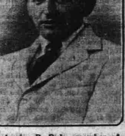
Jack Holt in "The Call of the North" — Mack Sennett Comedy

ASTORIA, Ore., Sept. 10.—More of the loggers who quit work in the lower river camps last Saturday on account of the IWW strike, returned to the camps today. The Eastern and Western Lumber company, whose camp was the most seriously affected of any was running one side and indications were that all camps in the district will be operating full force by Wednesday.