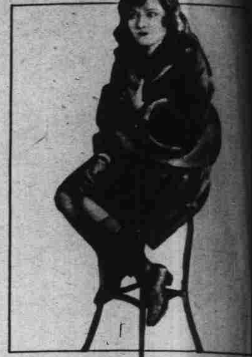
Gloria as a little girl.

"Own your own home," says Gloria Swanson. Her new Hollywood residence.