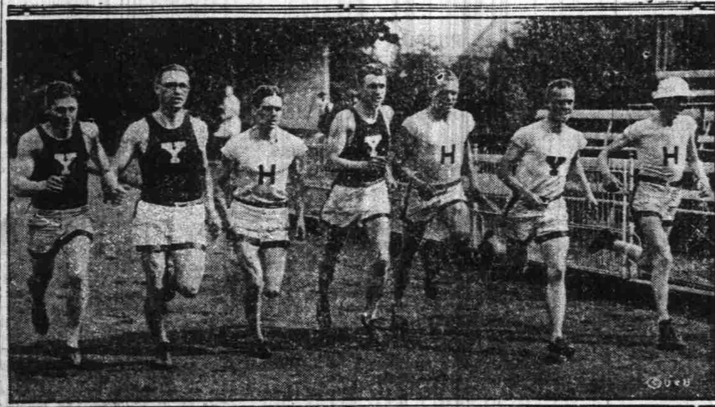
First photo to arrive in America showing Harvard and Yale athletes out for trial spin on London racetrack, where they contested with the picked runners of Oxford and Cambridge.