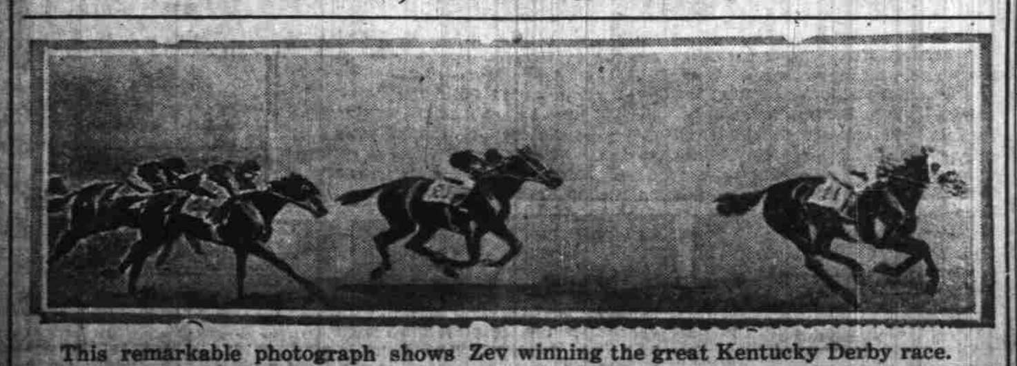
This remarkable photograph shows Zev winning the great Kentucky Derby race.