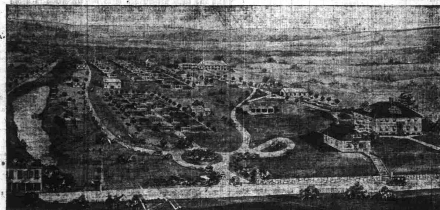
MODERN POULTRY PLANT, THE KIND THAT YOU WILL OWN WHEN YOU REALIZE YOUR AMBITION