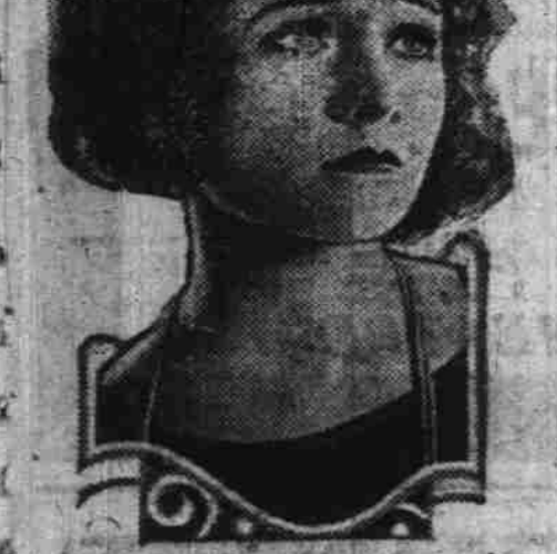
Betty Compson in the Paramount Picture "Kick In" A George Fitzmaurice Production.