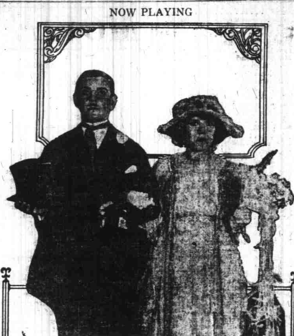
HARRY MYERS AND LOUISE FAZENDA in THE BEAUTIFUL AND DAMNED WARNER BROS. PRODUCTION