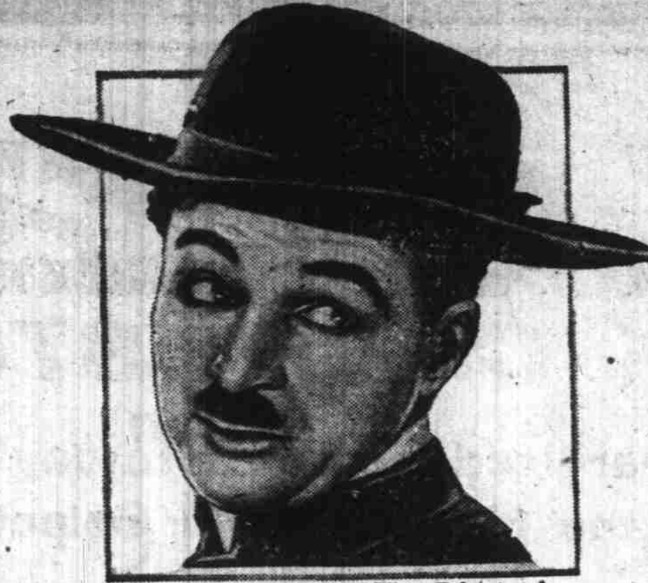
Charles Chaplin in "The Pilgrim"