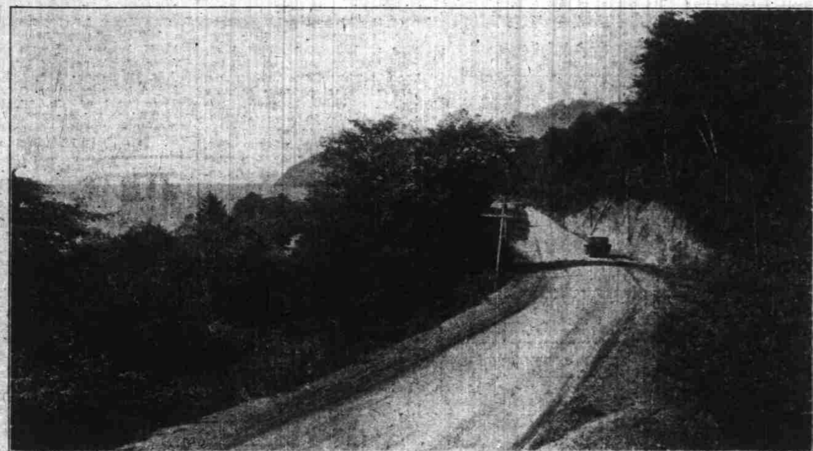
ON THE ROOSEVELT COAST HIGHWAY IN NORTHERN TILLAMOOK COUNTY AT A POINT WHERE THE HIGHWAY FOLLOWS CLOSELY THE SHORE LINE OF THE PACIFIC OCEAN

SALEM NURSERY COMPANY 425 Oregon Building Phone 1763 Additional Salesmen Wanted