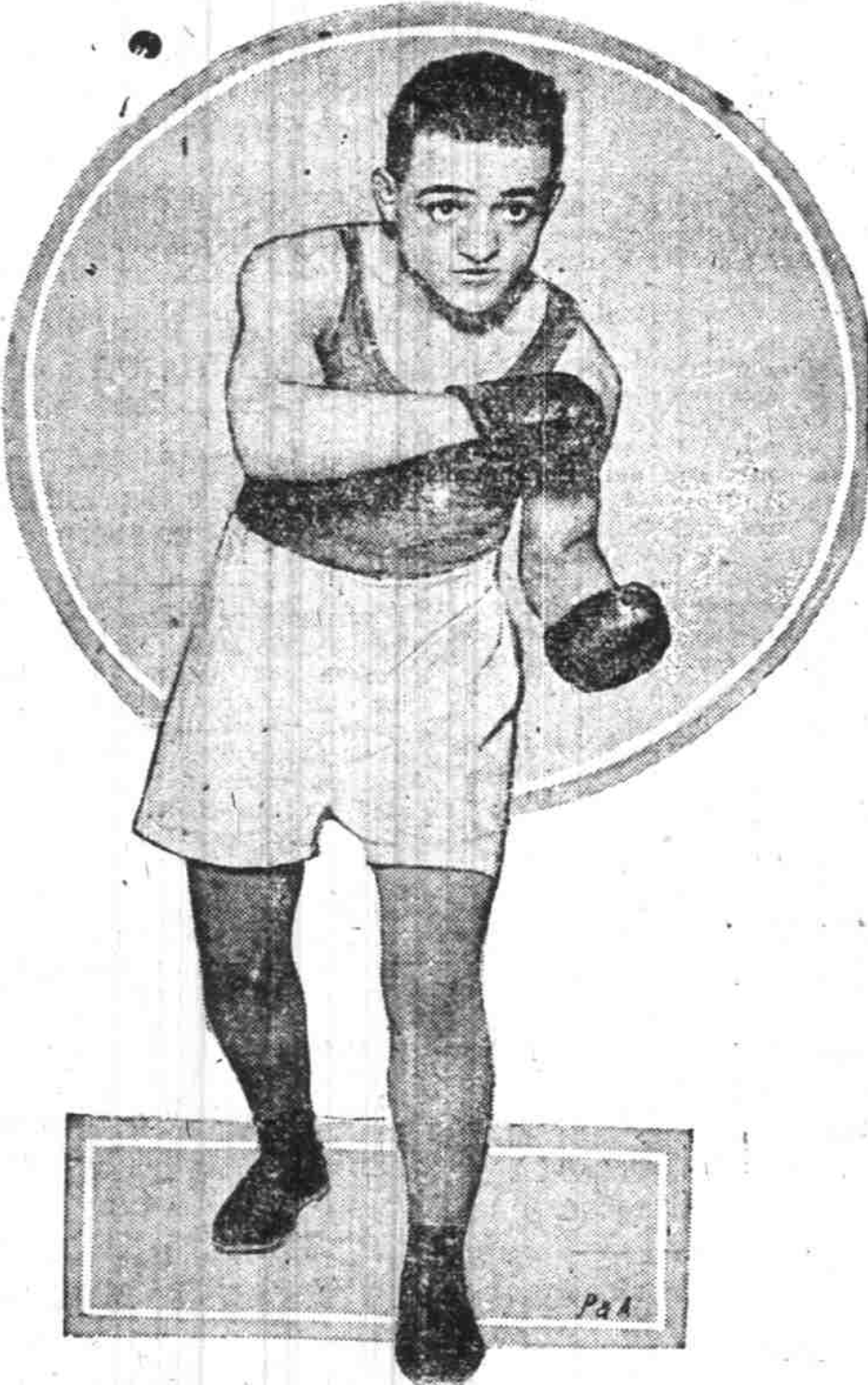
Frankie Genaro, who became the flyweight champion of America by defeating Pancho Villa in a fifteen round contest in Madison Square Garden.