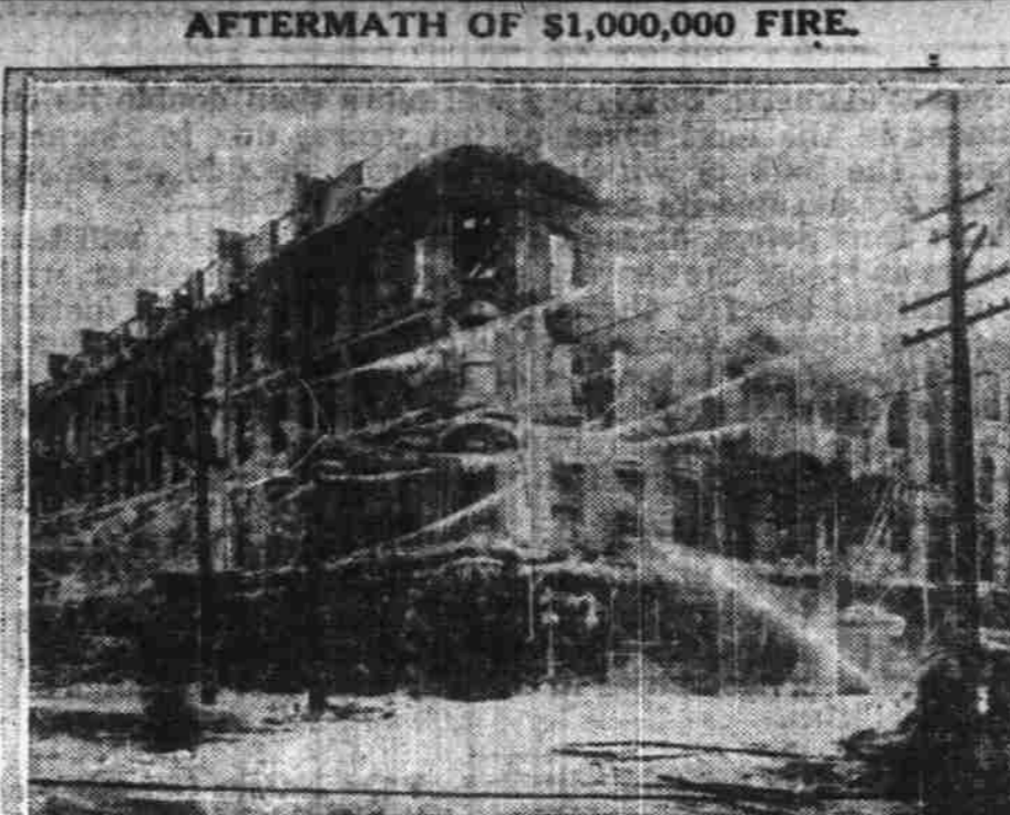
Picture shows the ruins of Lester Block in the heart of Hamilton, Ontario, which was gutted by fire with a loss of $1,000,000. The building housed 150 stores, offices and apartments.

CHICHESTER'S PILLS SOLD BY DRUGGISTS EVERYWHERE