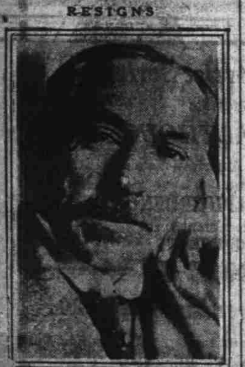
William Morris Hughes, Premier and Minister of Foreign Affairs for Australia, has resigned.

DEPUTY SHERIFFS PLANT BOOZE AS JOKE ON FRIEND Two Marion county deputy sheriffs, who occasionally frequent the store of a certain Salem merchant, this week found on the street, near the merchant's shop, a pint flask partially filled with moonshine liquor. Entering the establishment one of the officers engaged the clerk in conversation while the second man "planted" the liquor in an obscure niche on the main floor. Two days later two deputy sheriffs with grave expressions on their faces entered the man's store. They called the proprietor, who has a slight impediment in his speech, to one side. They explained they were sorry but were forced to ask if he had any liquor in his establishment. "No," he said, indignantly. "You don't mind if we search?" The officers of the day launched an inspection. Various corners were gone into. Articles were moved. Finally one of the men dug from a corner the bottle he had placed there two days earlier. He uncorked it, whiffed its contents. Slowly he turned to the proprietor. "What," he said, "have you to say about this?" The proprietor, for a second, stood aghast. Then: "All I've e-g-got to s-s-say is," he began, "is that that d-d-damn stuff is s-s-supposed to be kept in the b-b-ase-ment!" The two deputies departed. The store, they were forced to admit, was not on the proprietor of the store.