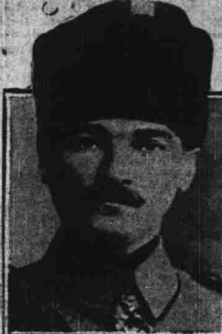
GEORGE OF TURKEY.

A highly important exclusive interview was cabled from Angora with Kemal Pasha, dictator of Turkish Nationalists, who wants to be registered in history as George Washington of "New Turkey." Nothing but complete independence for Turkey will satisfy him. Unless European powers are prepared to recognize this he says he is ready to continue the struggle. He criticizes United States attitude in Near East, declaring that Washington is deceived by European agents. Likewise he is an ardent prohibitionist.