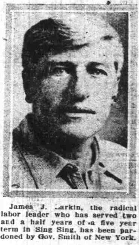
James J. Larkin, the radical labor leader who has served two and a half years of a five year term in Sing Sing, has been pardoned by Gov. Smith of New York.

man appears to mortals. In this perfect man the Savior saw God's own likeness, and this correct view of man healed the sick.