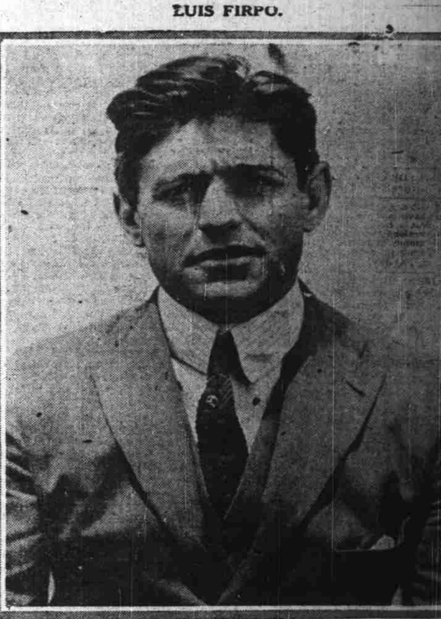
This South American heavyweight is on his way to this country on his second visit to discuss with American promoters matches with heavyweights that will lead up to a title bout with Jack Dempsey, the champion of the world.