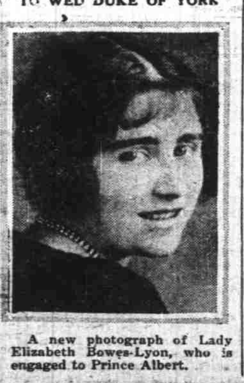
A new photograph of Lady Elizabeth Bowes-Lyon, who is engaged to Prince Albert.