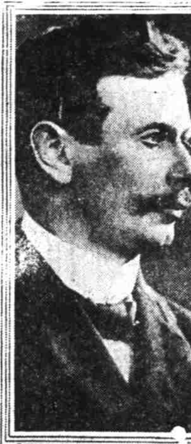
Dr. Joseph Wirth, German Minister of Foreign Affairs, who, with his Cabinet, has been forced to resign.