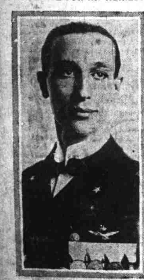
One of Italy's most fascinating and popular bachelors, the Duke of Spoleto, who has arrived in America. He is a nephew of the King and Queen of Italy.

in the best of health. He might be called the cowboy governor, and it wouldn't be doing him an injustice at all. He has been through the mill of the farm and ranch life, and there is no problem of rural affairs that he has not experienced.