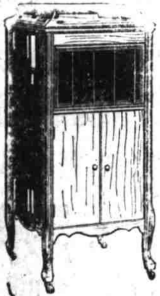
Second Prize Columbia Grafonola Type G-2 Value $125

A Grafonola of exceedingly artistic appearance. An example in design and finish of the best American craftsmanship. Finished in English brown mahogany. Equipped with shelves adequate for seven albums, each with a capacity for twelve records. Size, 46 1/2 inches high, 19 1/2 inches wide, 21 inches deep.