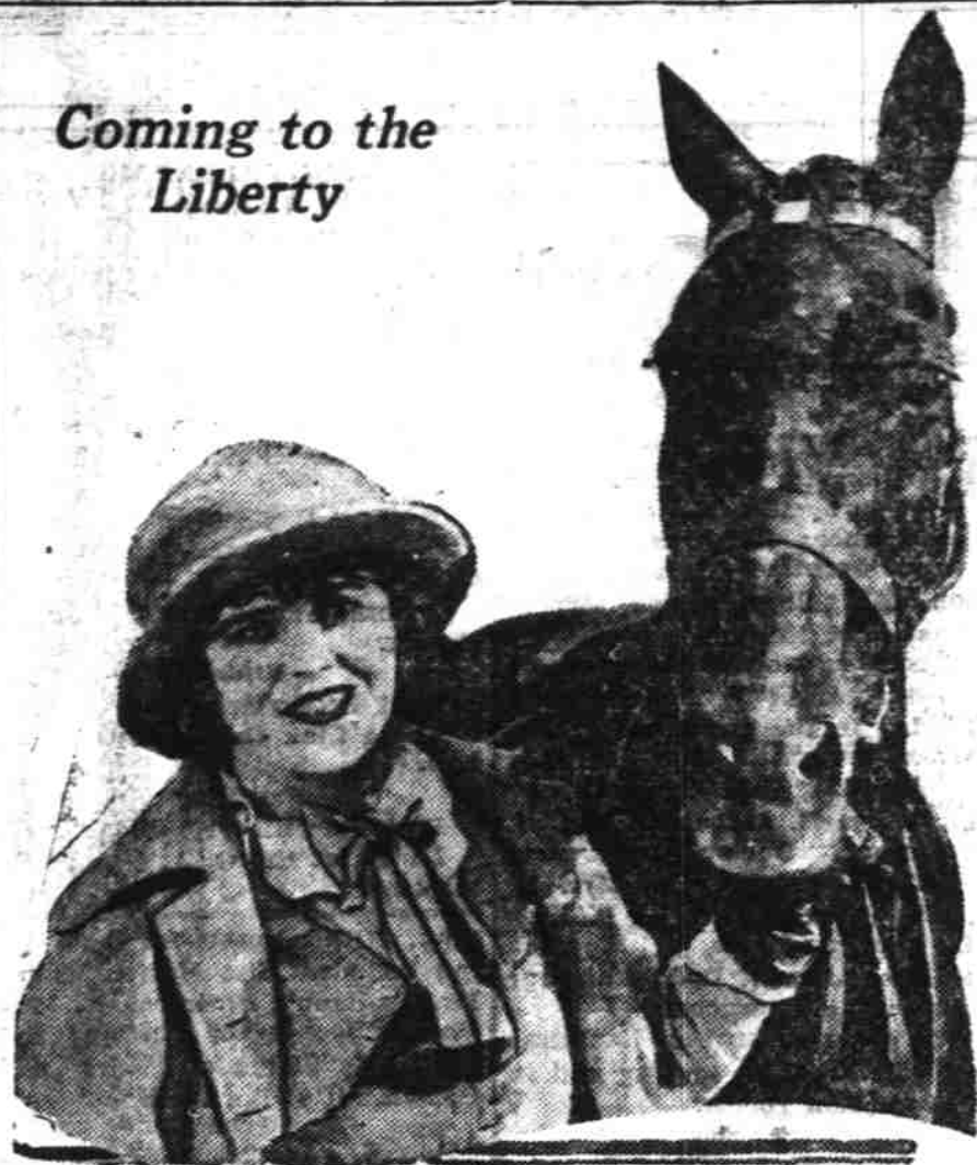
Ruth Roland in "The Timber Queen"