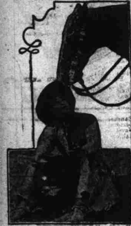
Tom Mix in "Just Tony."