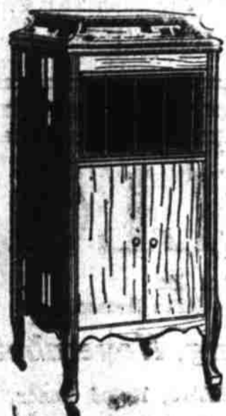
Second Prize Columbia Grafonola Type G-2 Value $125

YOU DO NOT NEED TO SPEND ONE CENT OF YOUR OWN MONEY