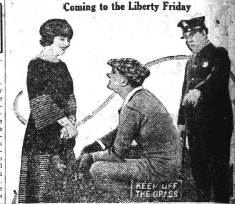
Bert Lytell in "The Right That Failed"

Norma Talmadge will open at the Oregon Theatre Saturday evening in her finest characterization, "The Eternal Flame" is the title of the photodrama and in this