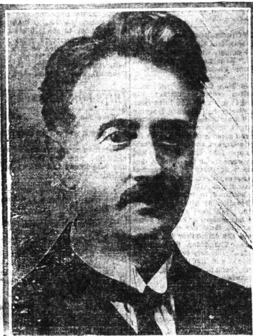
William T. Cosgrave, Minister of Local Government, who has been elected president of the Dail Eireann by the new Parliament, an office which makes him head of the Free State.

Shopwalker — She complains that you didn't show her common civility. Shop Girl—I showed her everything in my department, sir.