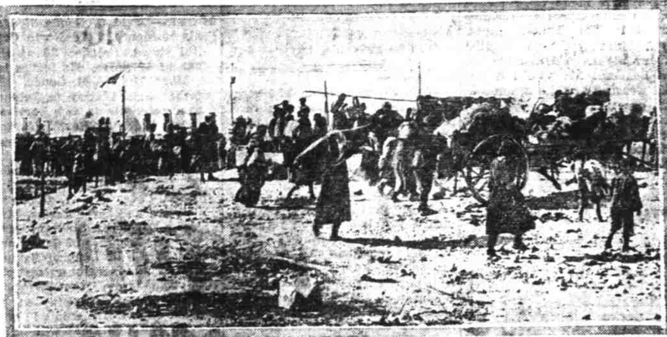
Filled with terror thousands of refugees fled from the city, which was held daily famine and massacre at the hands of the Turks. Photo shows them rushing to be taken off to places of safety.