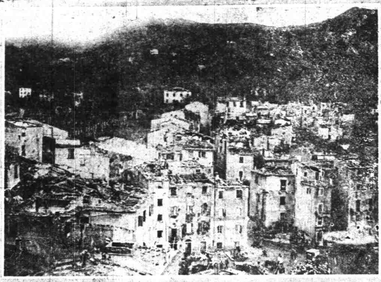
Two hundred were killed and seven hundred injured in a terrific blast of explosives at Fort Falconara, Italy. This is the first picture received showing Santo Tere Zio, which looks like a bombed city after the explosion.

been a pillar of the people's interests and the center of the world's desire."