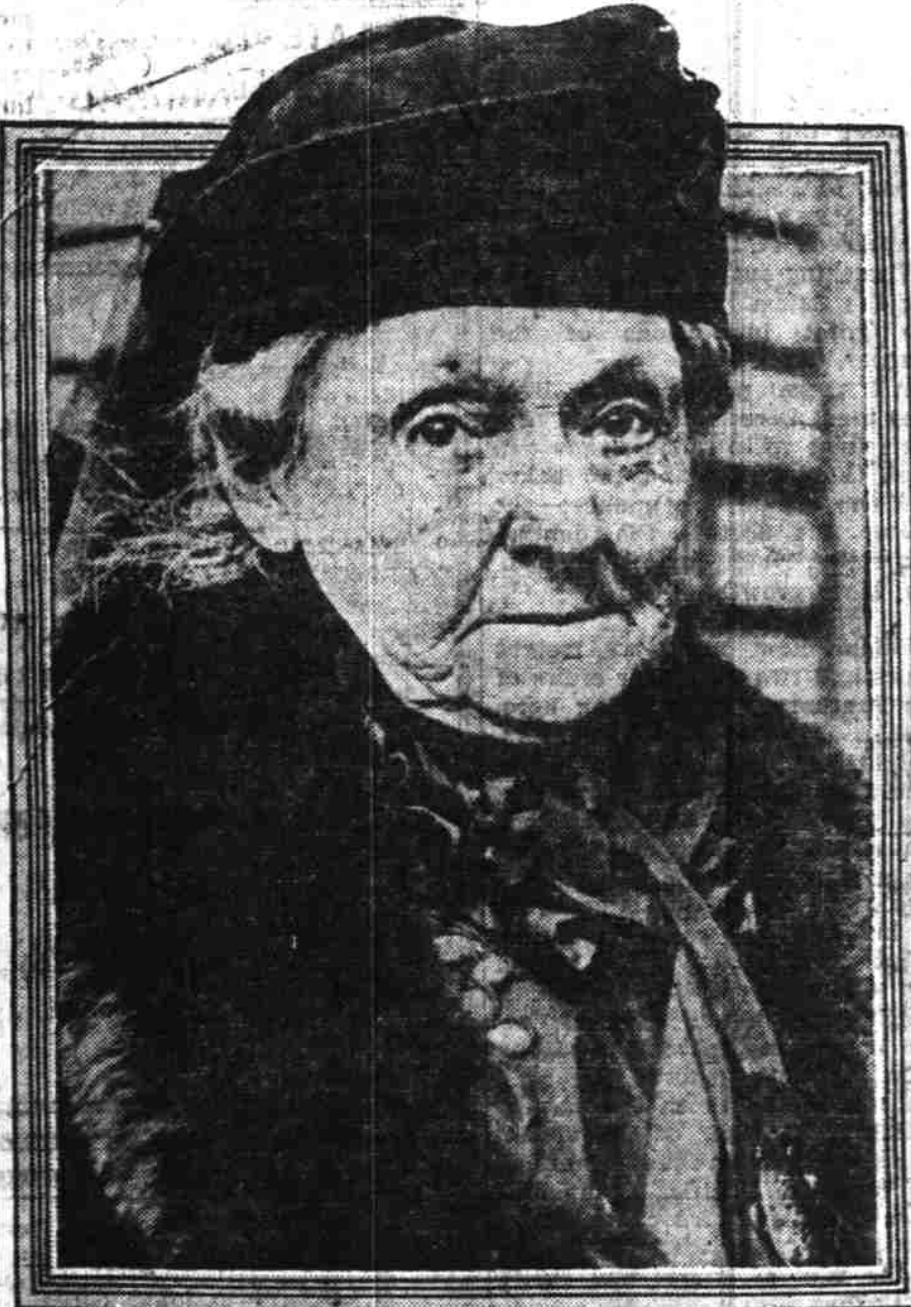
Mrs. William H. Felton, the first woman to be made a United States Senator and, though 87 years old, her power to think and act is equal to that of a man forty. She started into politics fifty years ago by electing her husband to the House of Representatives. Fancy a woman "stumping" in the crinoline period! And she wanted prohibition when Bryan was kicking at the slats in his crib.