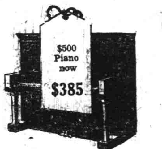
This piano is worth double the money. Terms $2 a week.

FACTS YOU SHOULD KNOW We have been here 43 years; we own our own building; we pay cash for every piano we buy and buy only in car lots. We are the only house in Salem that carries its own paper. We do not consign pianos and force you to pay a big price when you buy one. We are the only house in Salem that can say this. We can give you almost rental terms on the very best grades of pianos. These are facts you should know and remember, because it means money in your pocket. Think before you spend your hard-earned money.