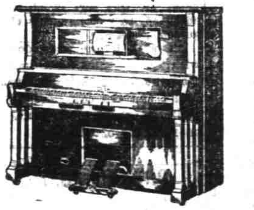
This beautiful new player piano for only $395 $2.50 a week