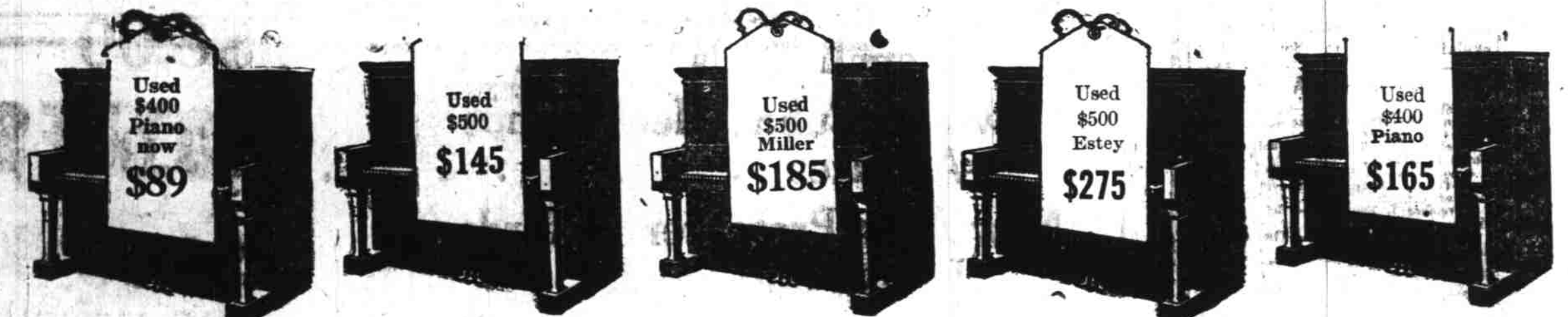
See this Piano; hear its wonderful tone. Terms only $5 down, $5 a month. This beautiful walnut case; big, deep, rich tone. Only $5 down, $1.50 a week. Here is a Piano you would be proud to own. Pay only $5 down, $1.50 a week. Be here and see this piano. This old standard make piano is in fine condition; beautiful mahogany case. $5 down, $2 a week. This is one of the best buys in the entire house. Pay only $5 down, $1.50 a week.

delay. Just think of buying a piano for $89 and only paying $5 down and $5 a month; but that is exactly what you can do if you act right now—but if you delay the greatest opportunity our word for this sale, but come down and roam through our big warerooms and see for yourself. Come now—don't put it off another day.