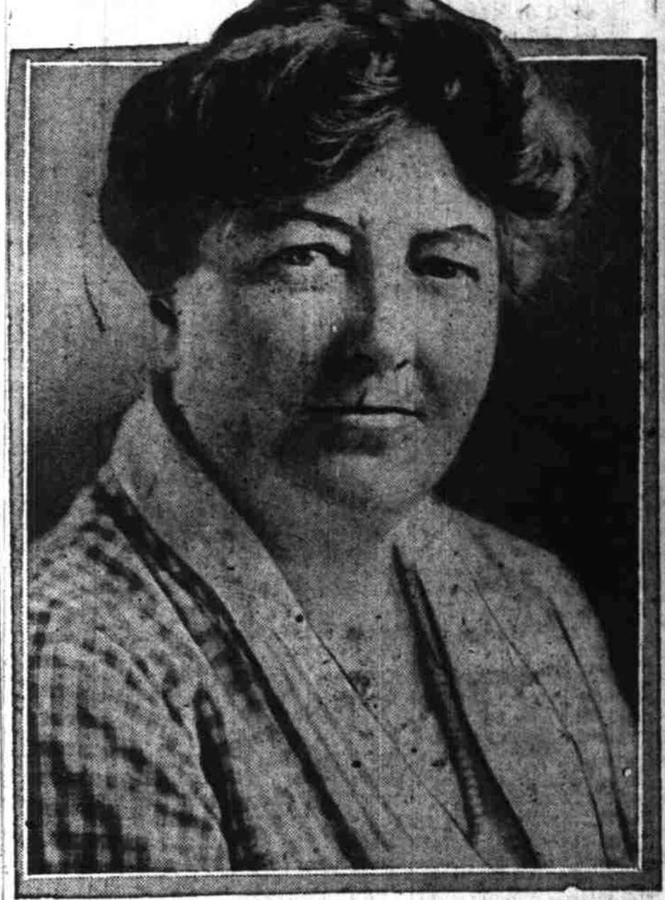
Miss Mary Anderson, director of the Woman's Bureau, Department of Labor. More than 8,000,000 employed women in the United States are her special charges. She has a staff of thirty assistants.