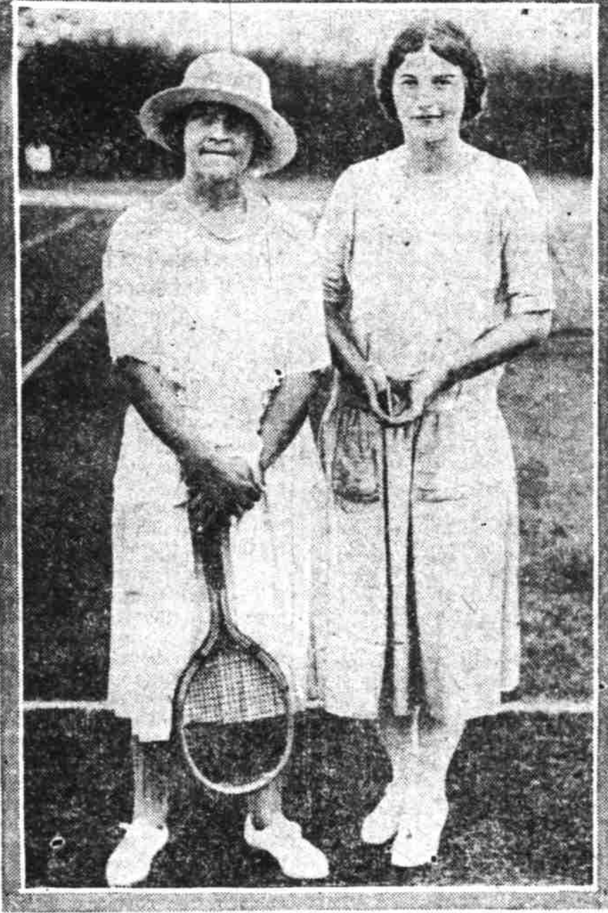
On the left, Mrs. May B. Sutton Bundy, who was national champion back in 1904 and is still making all the top notches hustle to keep up with her when she gets a racquet in her hand. With her, Miss Helen Willis, 16 years old, who experts predict will lead them all before long.