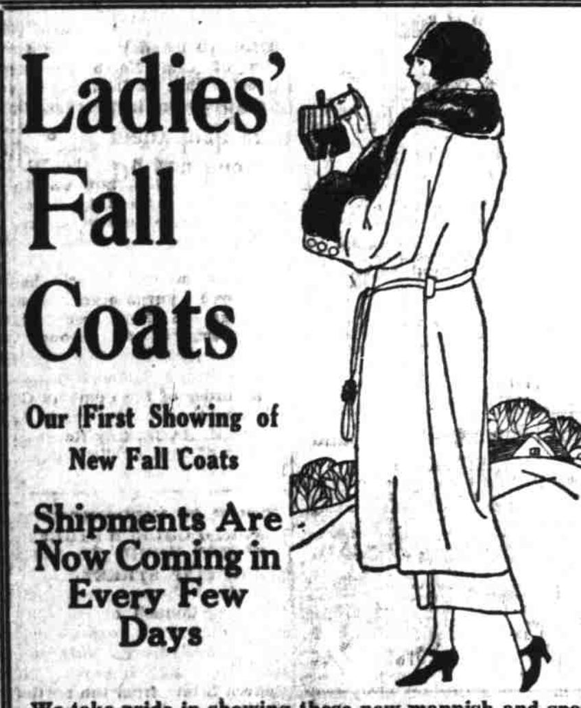
models that embrace all the styles of the season. .. They are the product of America's leading style makers. Our buying direct saves you all the middleman's profit.