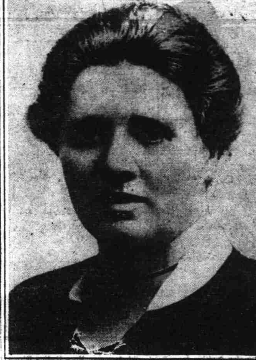
Mrs. Margaret Wintringham, widow of Thomas Wintringham, M. P., represents Lincolnshire in the House of Commons and sits with Mr. Asquith's supporters.