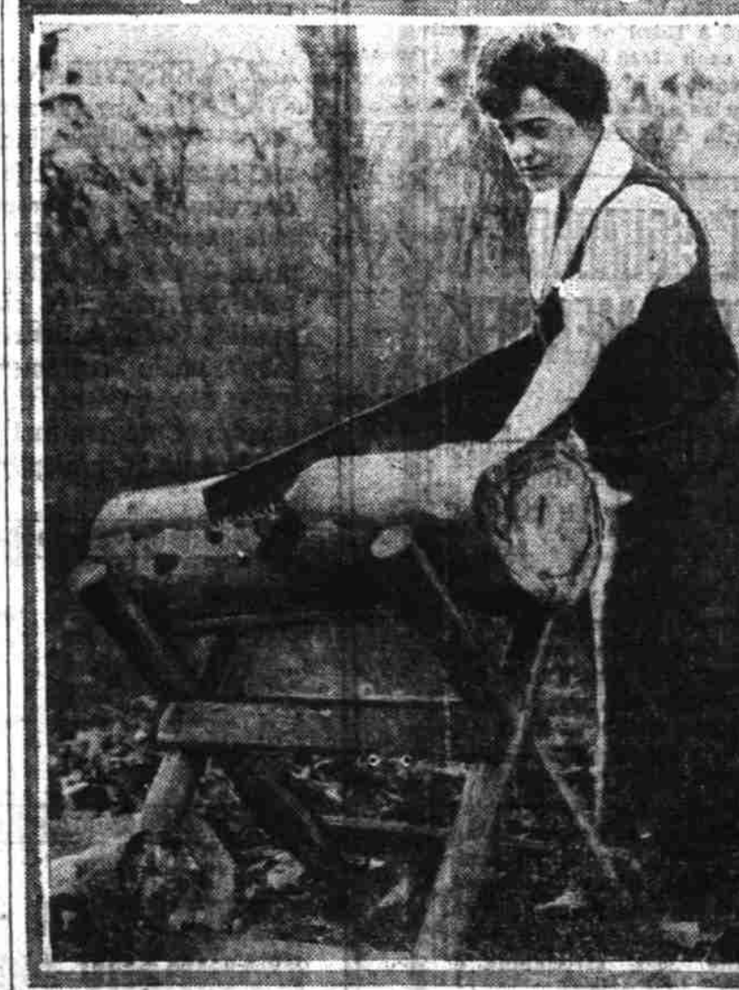
Mrs. Mary Roberts Rinehart, noted author, snapped at her summer home, while indulging in her favorite vacation exercise. Mrs. Rinehart was recently picked as one of America's most prominent women.