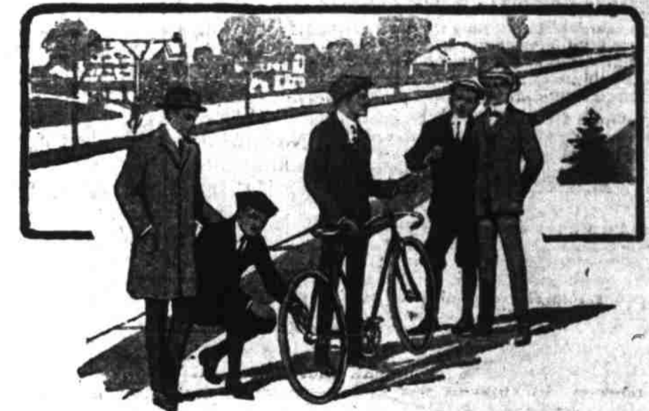
Third Prize—Harley-Davidson Bicycle

No subscription accepted for more than two years. Sunday only subscriptions count 20% as many votes as daily subscriptions.