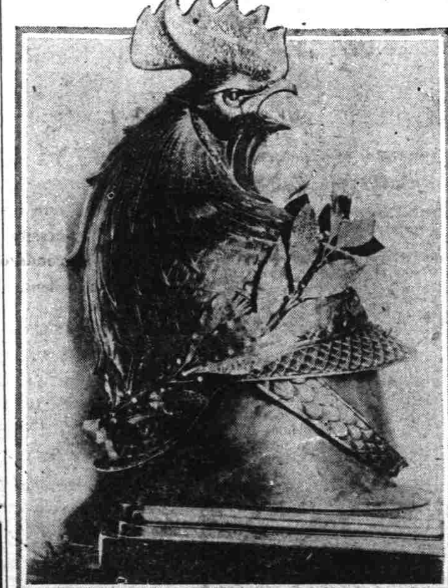
Among the unique and treasured exhibits at the exposition recently opened at the Palais de La Legion d'Honneur, in Paris, is this helmet of massive gold, bearing the French coc on the crest. It was presented by the people of America to Marshal Foch on the occasion of his recent visit to this country.