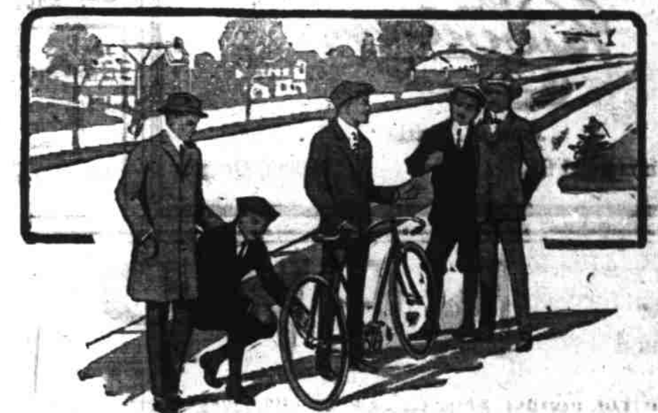
Third Prize—Harley-Davidson Bicycle

No subscription accepted for more than two years. Sunday only subscriptions count 20% as many votes as daily subscriptions.