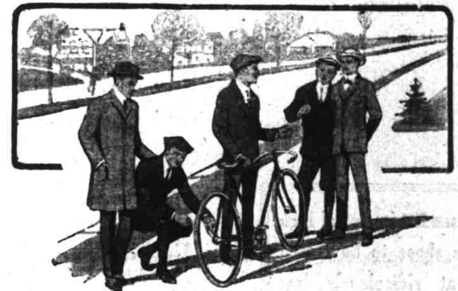
Third Prize—Harley-Davidson Bicycle

No subscription accepted for more than two years. Sunday only subscriptions count 20% as many votes as daily subscriptions.