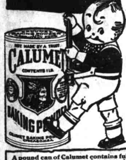
A pound can of Calumet contains full 16 oz. Some baking powders come in 12 oz. cans instead of 16 oz. cans. Be sure you get a pound when you want it.

Don't have success with your baking today and failure tomorrow. Have perfect economical results every time you bake—you can do it if you use CALUMET BAKING POWDER If it were not pure—most dependable—most economical, it would not be the world's biggest selling brand today. No human hands ever touch Calumet—it is made in the largest and most sanitary baking powder factories on earth.