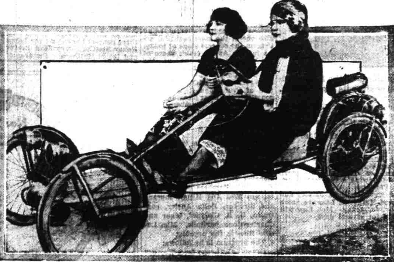
Viola Dana and Alice Lake, all ready for a ride along the southern California boulevards in their new style gasoline wagon, which is proving to be popular in Los Angeles and the rest of the film cities. The contraption can make about thirty-five miles per hour.

walking the kids of that county save, the buses each travel 35 miles on their way to school every morning, and the same distance going home. In another case, that of Winnebago Community school near Rockford Ill., 30 or more children travel to school each morning in the comfortable, roomy interior of a Graham Brothers school bus with Dodge Brothers power plant.